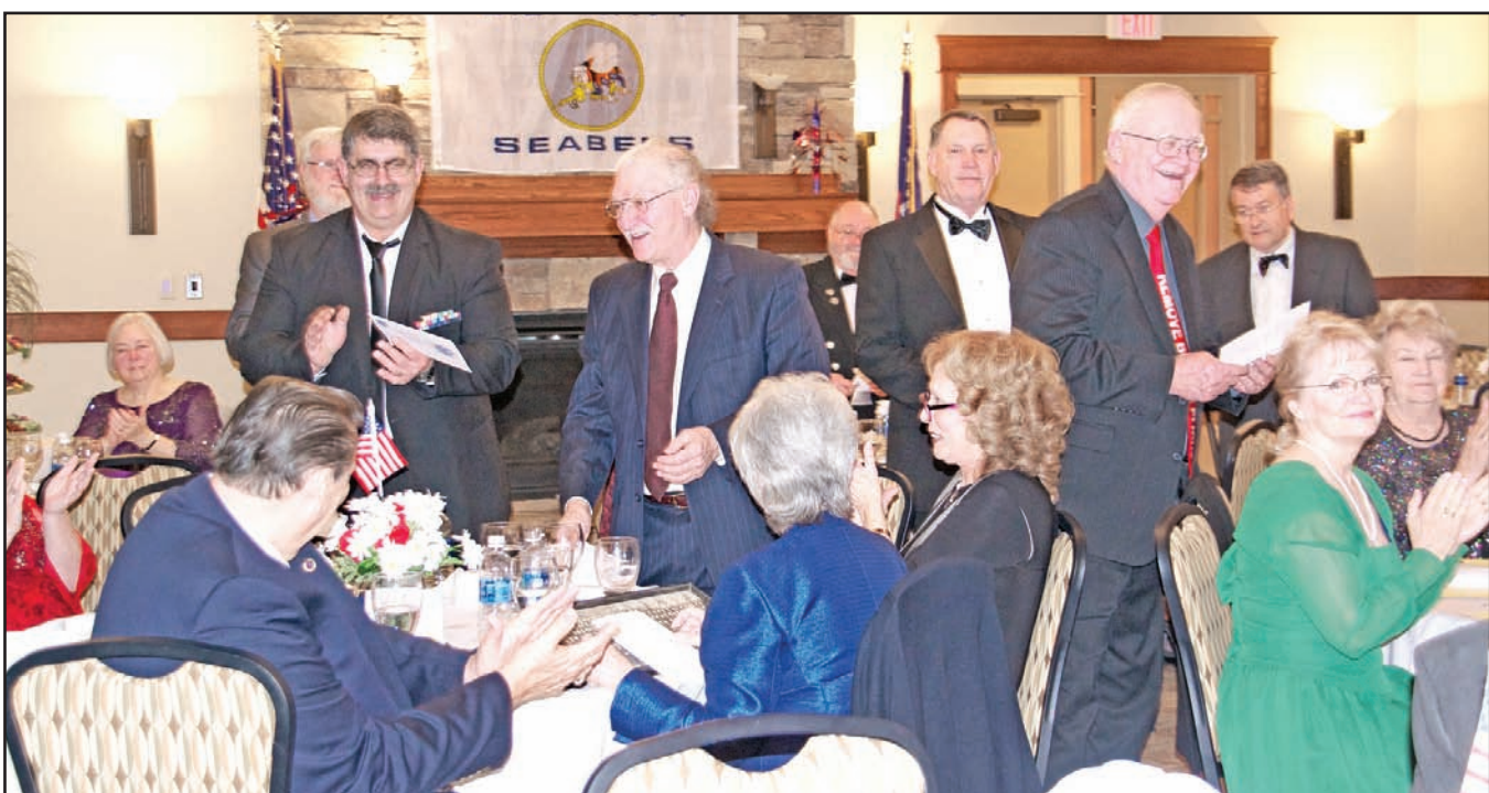
Seabees stood together to sing "The Song of the Seabees" that evening, which was written in 1943 and honors their timeless traditions.

showing the true comradery of veterans in the Southeast.